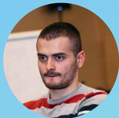
Granit Temaj @granit.temaj