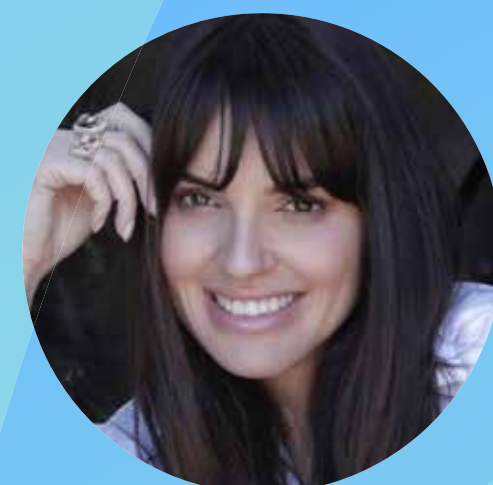
Ana Rustemi TV presenter & Influencer